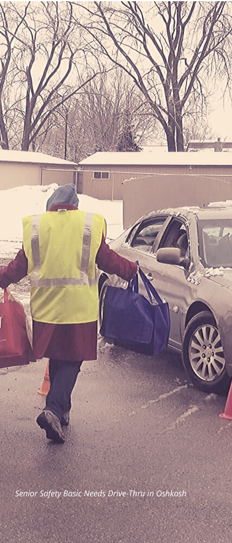
Senior Safety Basic Needs Drive-Thru in Oshkosh

Working on the frontline to support people with basic needs, we've known for a long time that poverty scenarios are more commonplace than you might imagine. Consider: